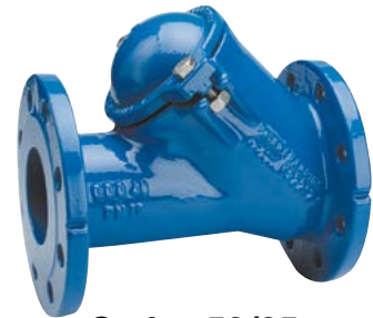
Series 53/35 DN50 & DN65