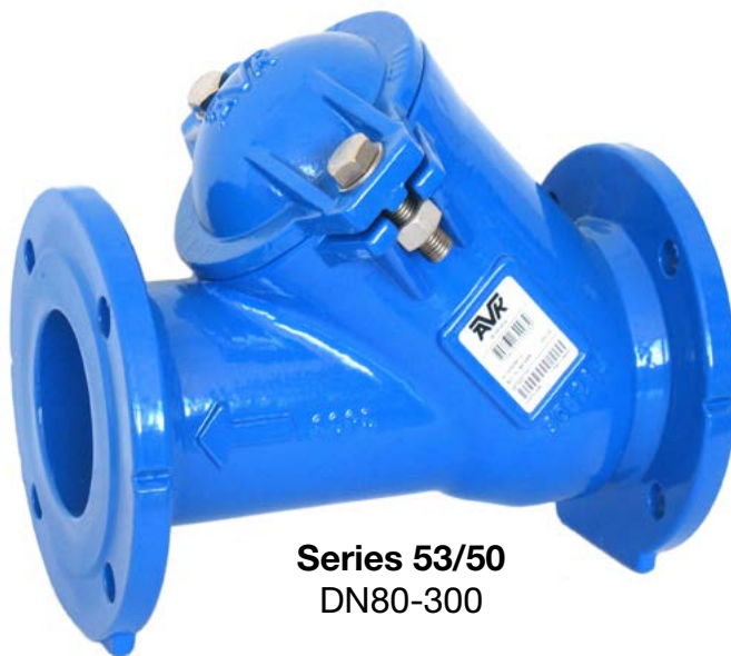
Series 53/50 DN80-300